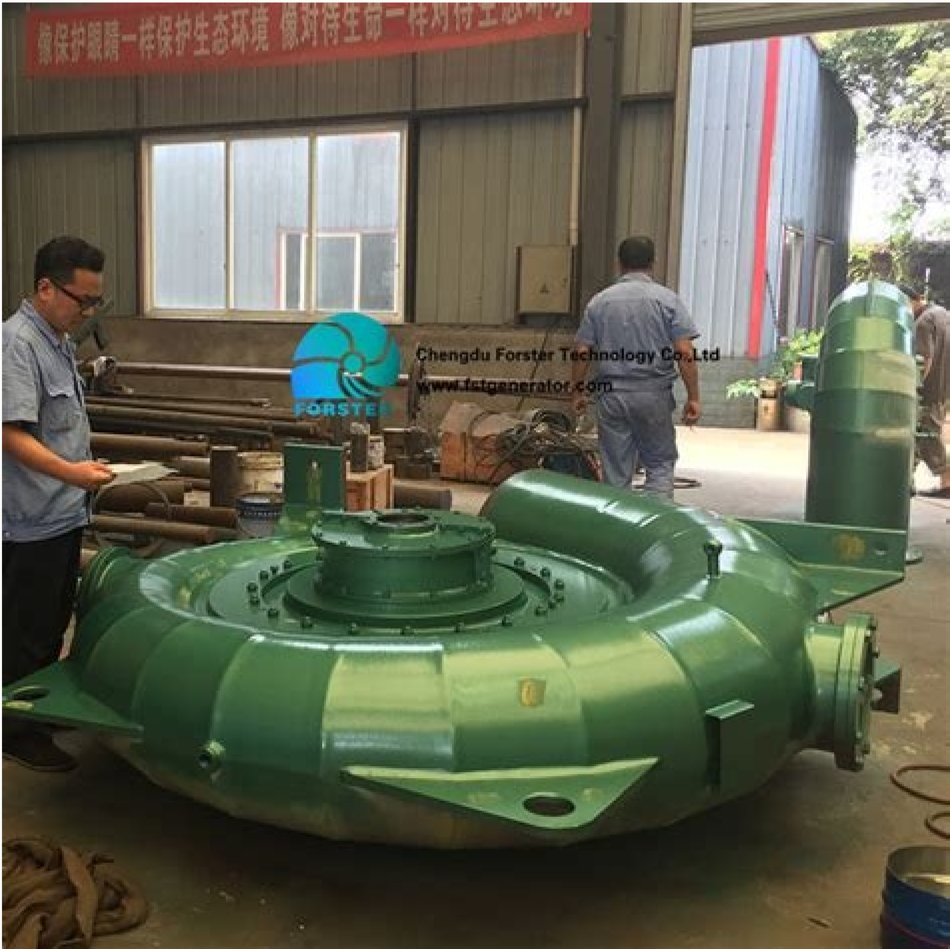
Water pressure monitoring device